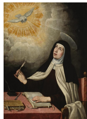
(St. Teresa's Bookmark)

Let nothing disturb you; nothing frighten you. All things are passing. God never changes. Patience obtains all things. Nothing is wanting to him who possesses God. God alone suffices.